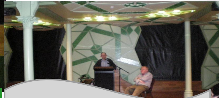
Hosted Self advocacy stream at ASSID national conference 2009