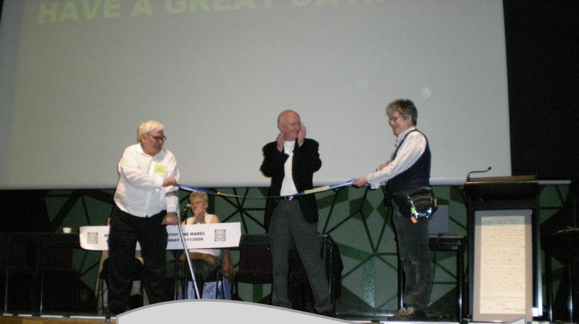
Reunion at Storey Hall RMIT November 2008